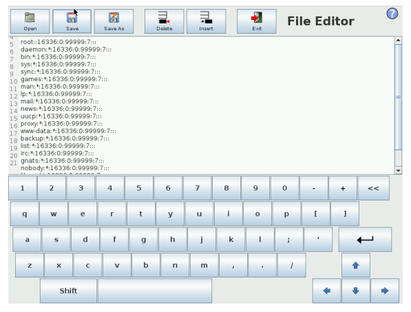
Fig. 2 The text editor running in the Universal Robot's PolyScope interface, editing arbitrary files as the root user.

Bad Magic. In Universal Robot controllers, magic files are in charge of executing maintenance and management tasks, such as backing up log files and configurations [31]. Technically, they are simple shell scripts. The implementation of magic files allows for an automatic execution: when such a file is copied to the robot controller, it automatically executes as the root user with no integrity or validity check, just like the old and deprecated "autorun" functionality of